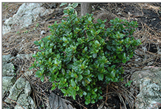
Little Rascal Meserve Holly