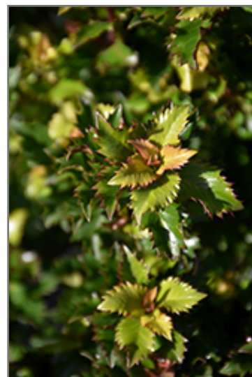
Little Rascal Meserve Holly foliage