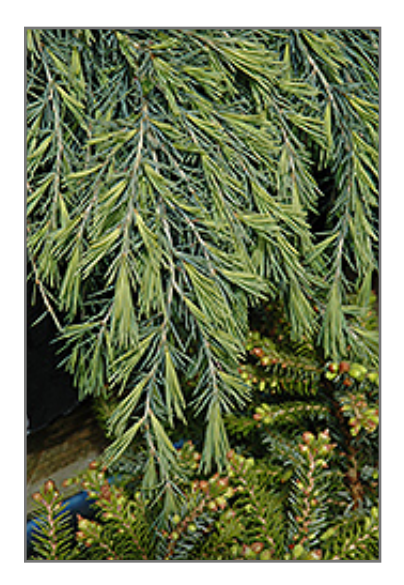
Feelin' Blue Deodar Cedar foliage