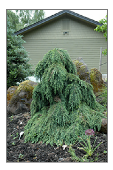
Feelin' Blue Deodar Cedar