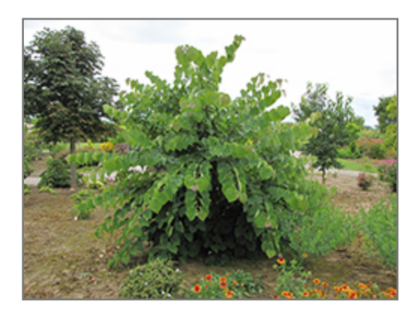
Little Woody Redbud

Little Woody Redbud is recommended for the following landscape applications;